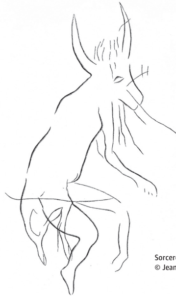
Sorcerer of Le Gabillou

The shaman is a liminal being – a sacral element that is in opposition to the profane community