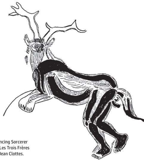
Dancing Sorcerer of Les Trois Frères.